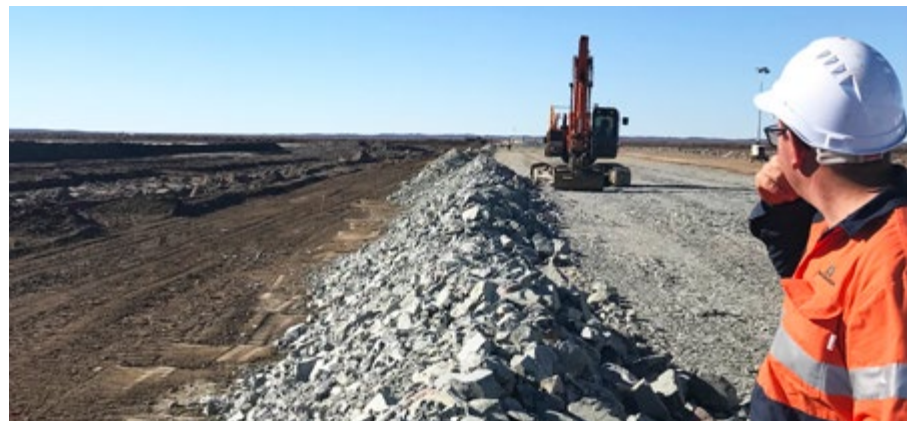
Mt Morgans Gold Project - June 2021

Macmahon raised both the 6 and 7 Ramp TSF facilities at the Peak Downs coal mine.